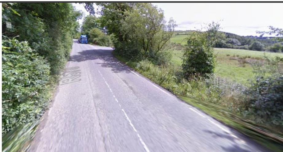
Water Station 2 (at 10.4km)