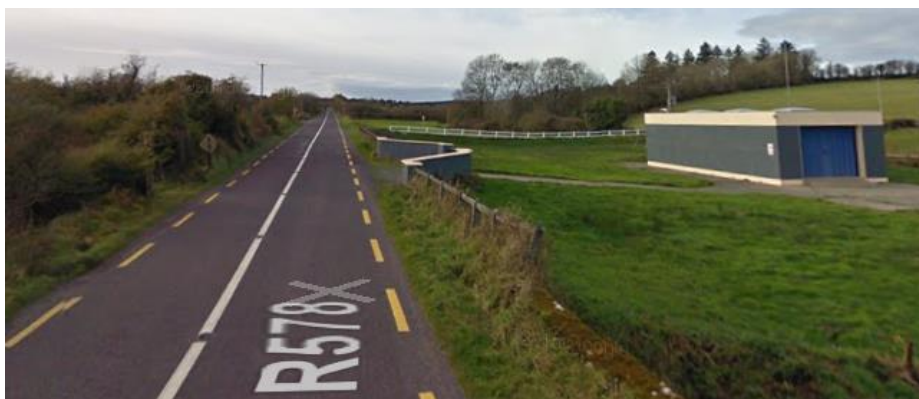
Water Station 1 (at 5.2km)